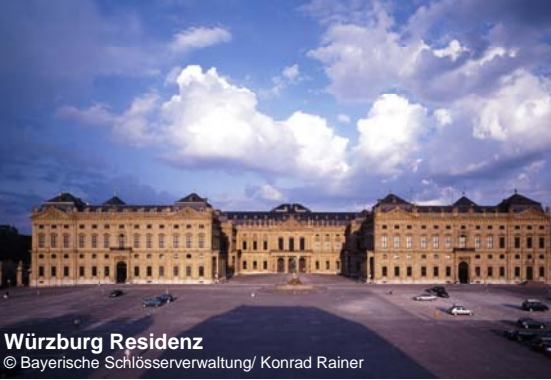
Würzburg Residenz