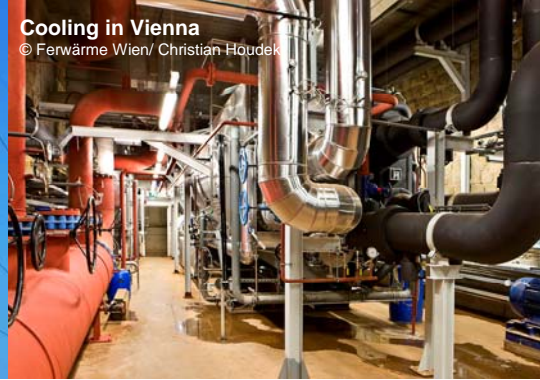
Cooling in Vienna