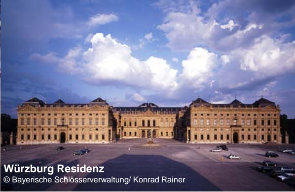
Würzburg Residenz