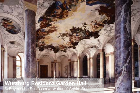
Würzburg Residenz Garden Hall