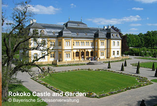
Rokoko Castle and Garden