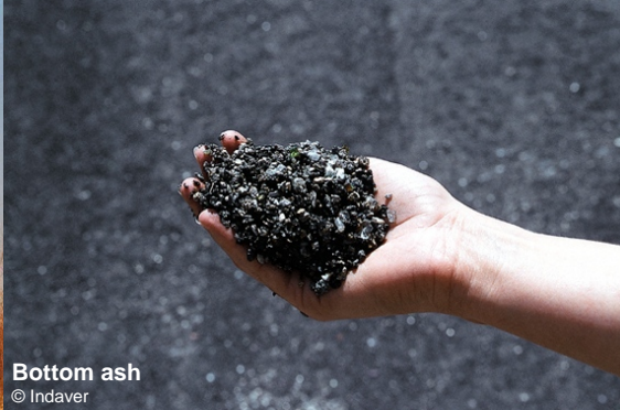
Würzburg Waste-to-Energy plant