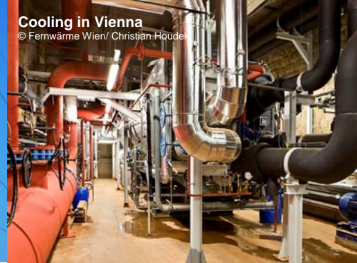
Cooling in Vienna