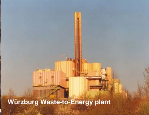
Würzburg Waste-to-Energy plant